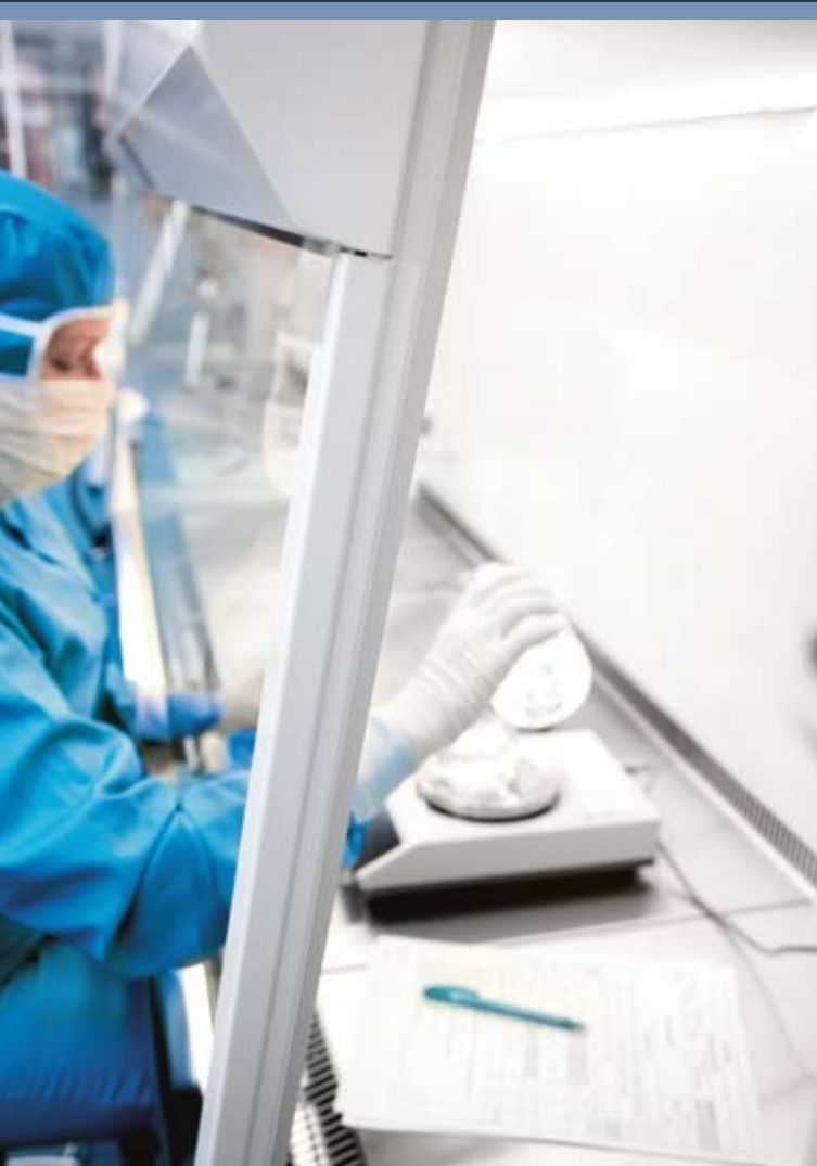
Diffused laminator technology allows shadow free light distribution throughout the chamber with light adjustment of 0-2000 Lux. illumination.