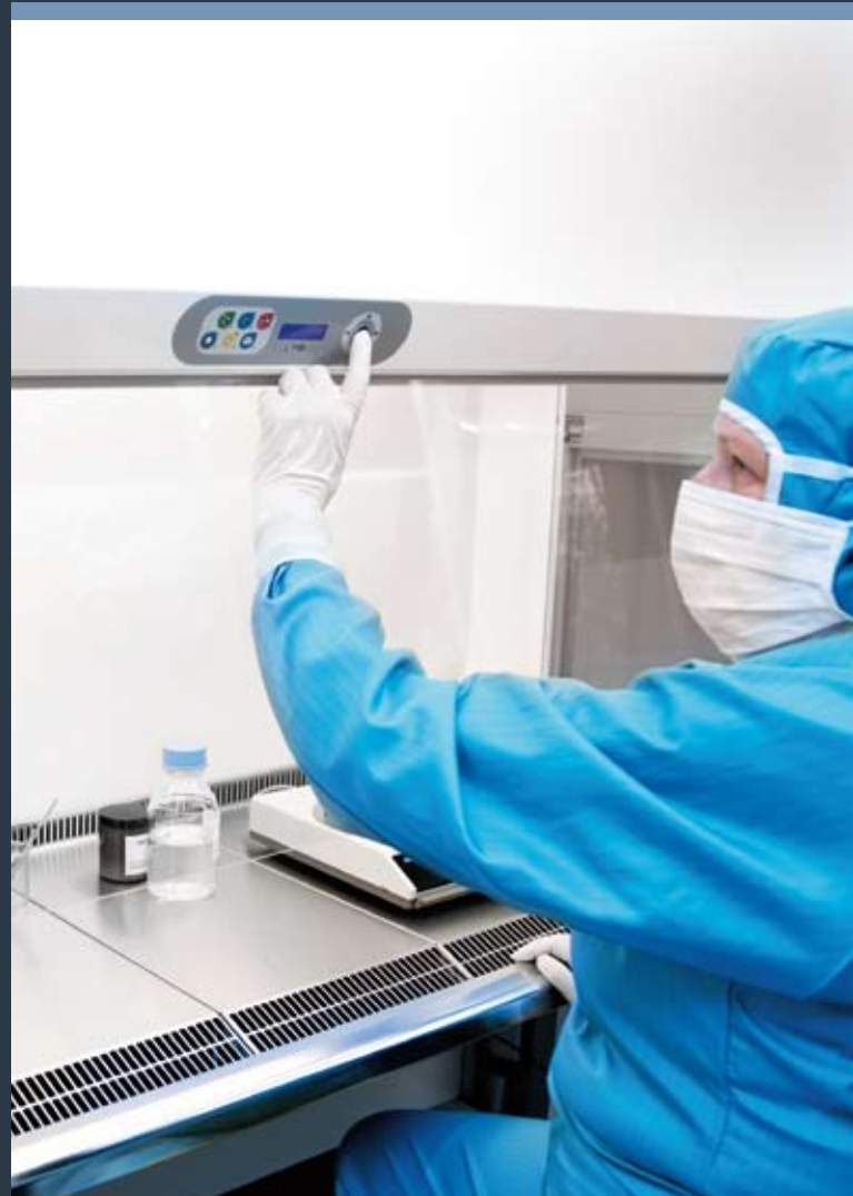
The cabinet can easily be adjusted from the service mode by authorized personnel. Down flow speeds can be adjusted from 0.10 m/s up to 0.55 m/s.